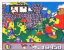
Land of the Gargantuas

If you have chosen either the Normal or Expert difficulty level, you can choose which of the 4 areas to begin your search. The areas are: